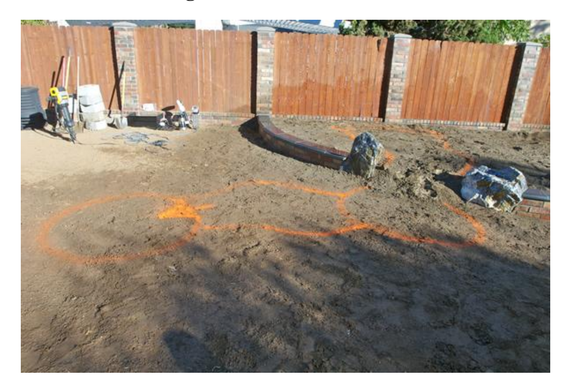
STEP 2: Marking Out the Basin and Waterfall/Stream

<u>BEFORE YOU DIG:</u> Before choosing your final location or doing any you must find out where your plumbing and electrical lines are buried. Calling 811 before you dig will notify your local utility companies and within a few days they will arrive to mark out your plumbing, phone, and electrical lines. Visit <a href="http://www.call811.com">http://www.call811.com</a> for more information.