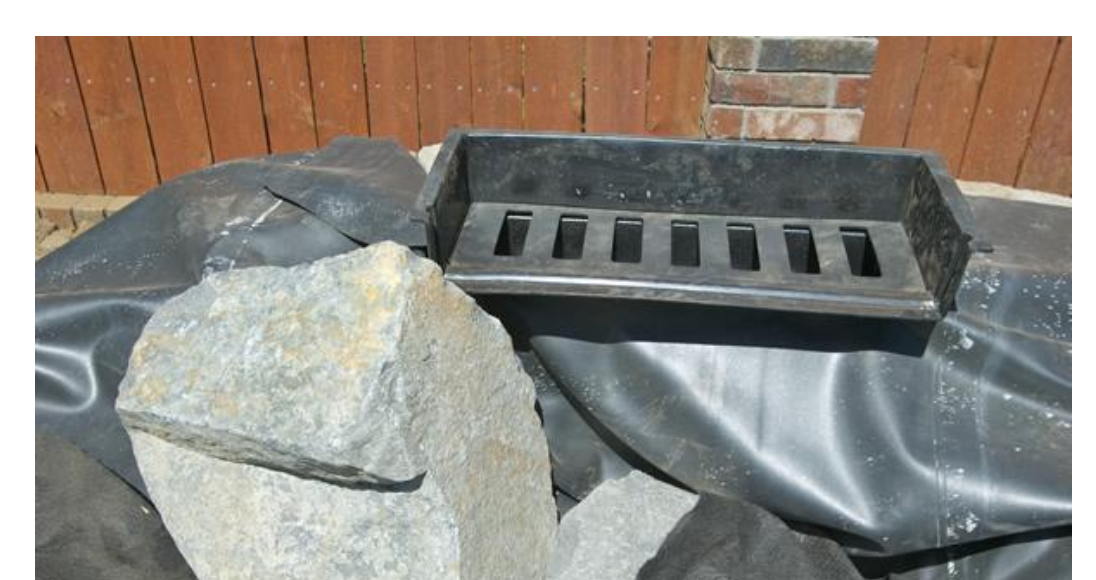
STEP 8: Rocking the Waterfall

At this point the assembly of your American Pond waterfall kit equipment is complete and the process of adding rock to your waterfall and basin begins. Start at the waterfall and work your way to the basin.